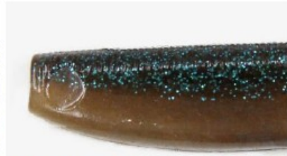
#03 Cinnamon Blue Flake Back