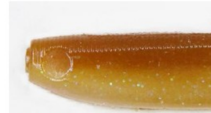
#04 Umber Shiner