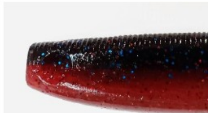
#12 Bloody Shad