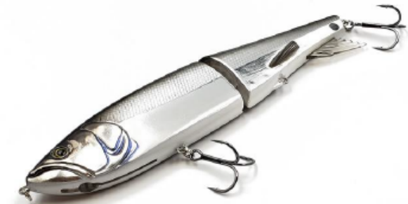
#12 Ultimate Flash