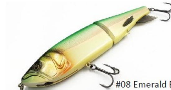
#08 Emerald Bone