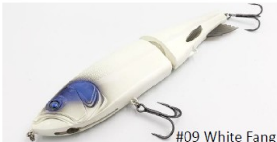
#09 White Fang