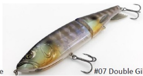
#07 Double Gill