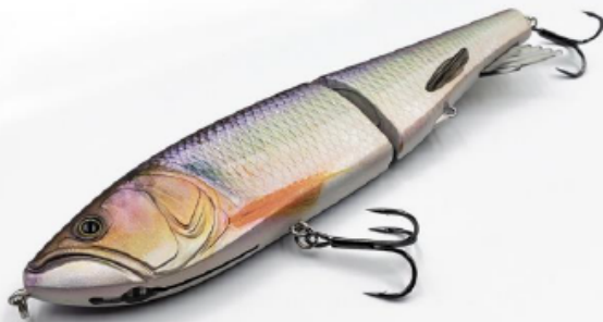
#205 Realistic Printed Real Ketabasu ♂