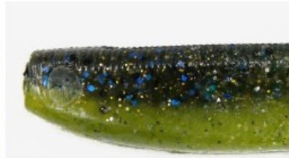
#02 Grass Gill