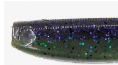
#07 Sprayed Grass