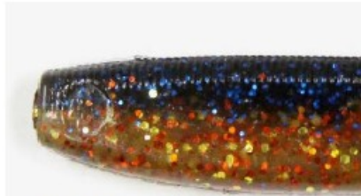
#01 Spawn Gill