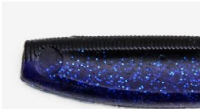
#11 Black Blue