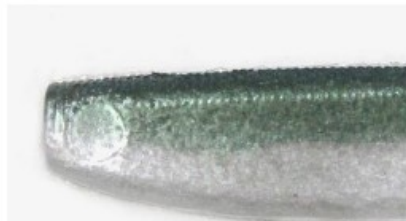
#09 Green Pearl Shiner