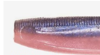
#13 Natural Pro Blue