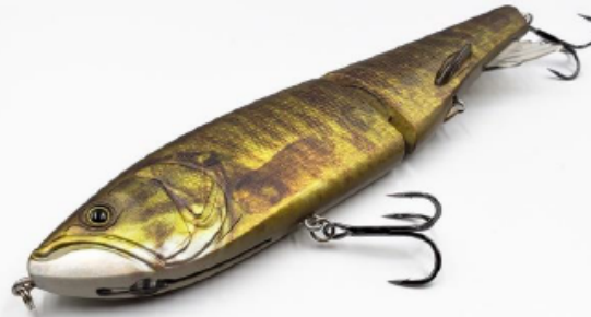
#203 Realistic Printed Real Smallmouth