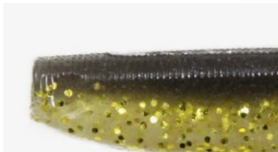
#05 Golden Shiner