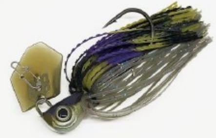
#06 Gloss Purple