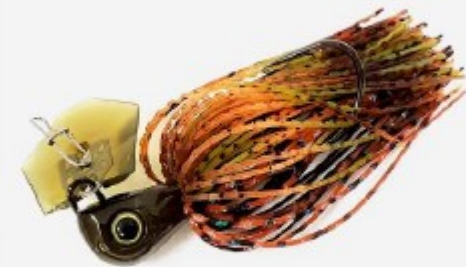
#09 Mud Bug