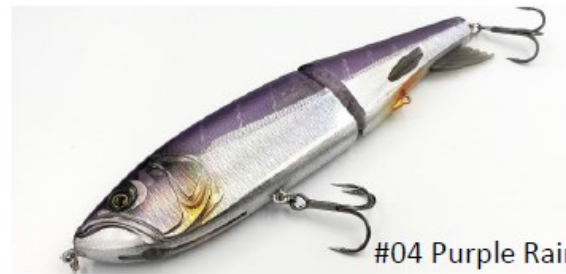
#04 Purple Rain