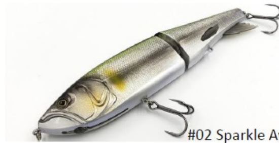
#02 Sparkle Ayu