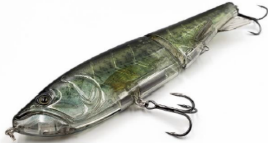
#202 Realistic Printed Ghost Real Largemouth