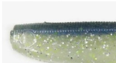
#06 Chart Flake Natural