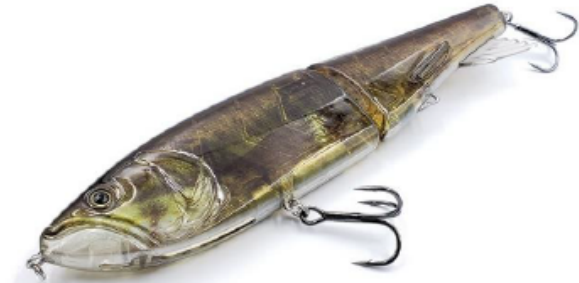
#204 Realistic Printed Ghost Real Smallmouth