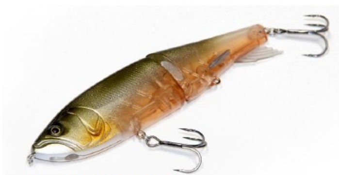
#13 SG SpawnShad