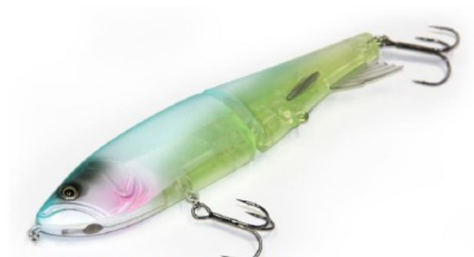
#14 SG TurquoiseBack