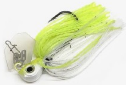
#05 White Chart