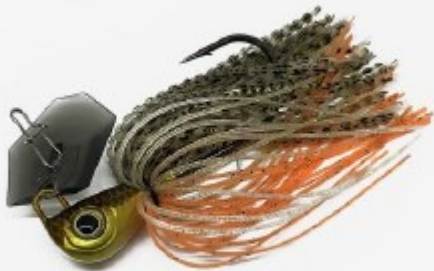
#07 Black Gold