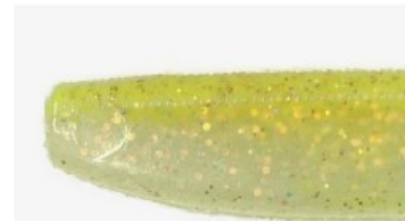
#10 Chart Back Hologram