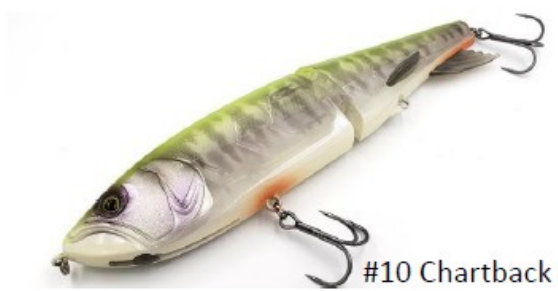
#10 Chartback Ghost Hasu