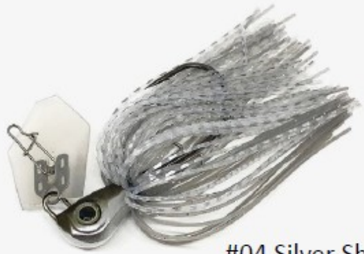
#04 Silver Shad