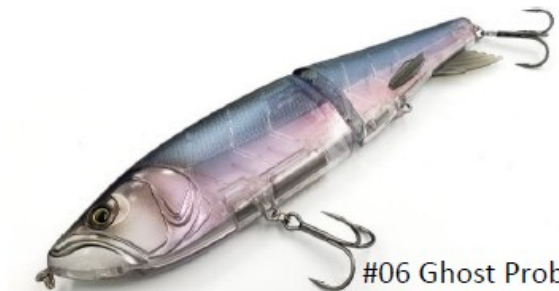
#06 Ghost Probleu