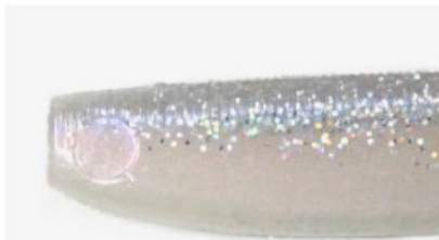
#08 Silver Pearl